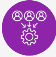
Manage and Notify